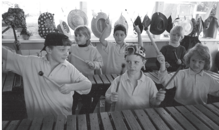
Kids, marimbas and hats, Shepparton.