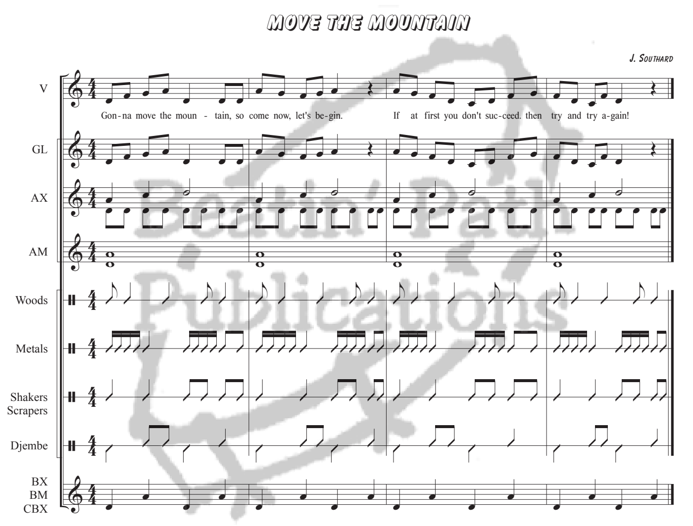
© 2020 Josh Southard. All rights reserved including public performance for profit.

Barred instruments; small hand percussion instruments; scarves