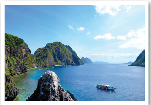
Palawan is known for its richly biodiverse marine life, pristine blue-green waters, and white sandy beaches.